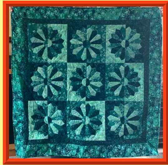
One of Sue Evan's gorgeous quilts

We will have updates on our upcoming events include Day Camp, the annual fabric sale, Medallion Quilts and Scrap Cities.