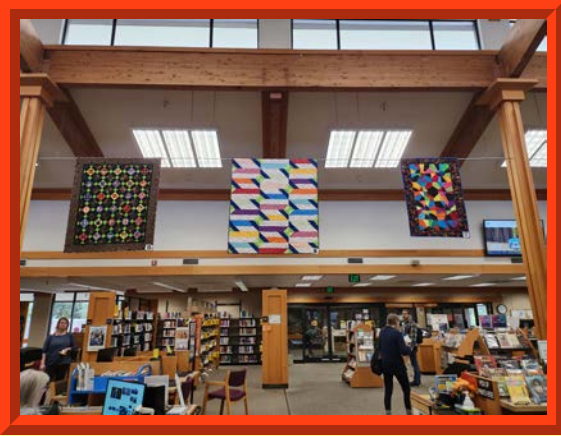
MQSC quilts in the wild 2025

Rincon Valley Library 6959 Montecito Blvd, Santa Rosa