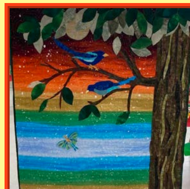
Noah Shaffer, Youth Category