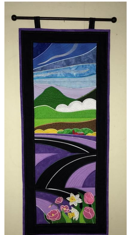
Patricia Bauer's "Road Through Wine Country"