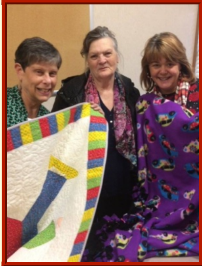
Community Quilts from the 2017-2018 Fire Relief project

6:30 p.m. social time, 7:00 p.m. meeting begins