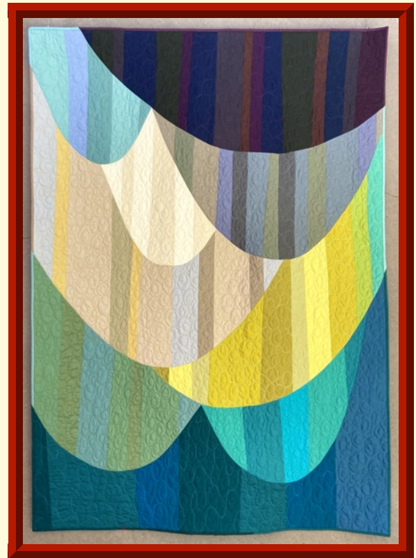
Oct Star Quilter Karen Bolan's Relax Quilt

Veterans Memorial Building, ( map ) 1351 Maple Drive, Santa Rosa Open to everyone In-person and zoom (zoom link for members only)